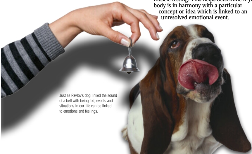
Just as Pavlov's dog linked the sound of a bell with being fed, events and situations in our life can be linked to emotions and feelings.

Finding and balancing these stuck memory loops is done with the help of simple muscle testing. This helps determine if your body is in harmony with a particular concept or idea which is linked to an unresolved emotional event.