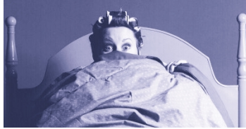
We always refer to all past memory events as an emotional reality, like a dream that may not be true, but our body thinks it is.

People used to think emotions resided entirely in their brain. Now we know other parts of the body can hold emotions too. Ever felt butterflies in your stomach before a speech, referred to something as a "pain in the neck" or felt a "lump in your throat"? Clearly, emotions happen in our body, not just our brain!