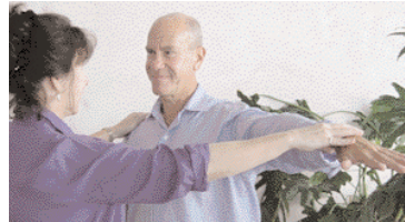
Testing the strength of your arm muscle can reveal your congruence with the statements that we pose.

NET is safe, effective and a natural way to instantly resolve long-standing health problems that have an emotional component.