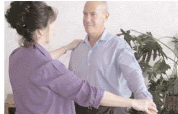
Muscle weakness is a sign your body is harboring an unresolved emotional response in your body. Time to get to work!